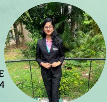
SHAINI BOSE 22-24

The book serves as a thought-provoking guide for marketers navigating the complexities of the digital age. Kotler's insights provide a roadmap for creating a more human-centered approach to marketing that leverages technology to enhance customer experiences while contributing to a better future for all.